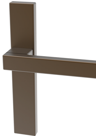
Plate Styles & Options

Recommended plate style - P1-B (38 x 220) - 38 wide minimum